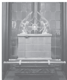
la bemaclie

WHY SHOULD I GO TO PERPETUAL EUCHARISTIC ADORATION? To deepen your personal relationship with Jesus and grow in faith, hope, and love. St. Peter Julian Eymard said that every time you look at Jesus in the Blessed Sacrament your place in heaven is raised. Besides that future goal, right now, here on earth, Jesus will give you His peace within you as you spend time with Him. Just as you can't be exposed to the sun without receiving its rays, neither can you come into the Light and Presence of Jesus in the Blessed Sacrament without receiving the divine rays, of His grace, His love, His peace. ("2009 Catholic Adoration")