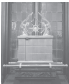
la bernacle

The hours of greatest need here at St. Augustin to fill our 24 hour commitment are: