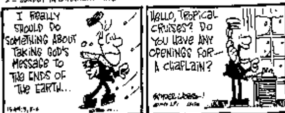
2nd SUNDAY IN ORDINARY TIME